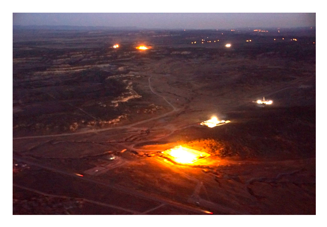
Flaring at Mancos shale wells in the Counselor/Lybrook area of San Juan, Rio Arriba, and Sandoval County area of New Mexico.

Mancos shale fracking and related development in the San Juan Basin of Northwestern New Mexico. Pictures taken in the Lybrook/Counselor area where San Juan, Rio Arriba, and Sandoval Counties meet.