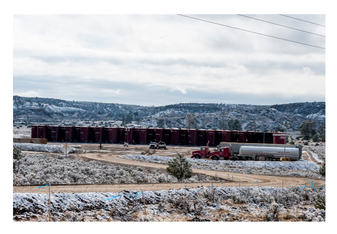
Above, Mancos shale fracking operation. Below, oil pipeline construction associated with Mancos shale development.